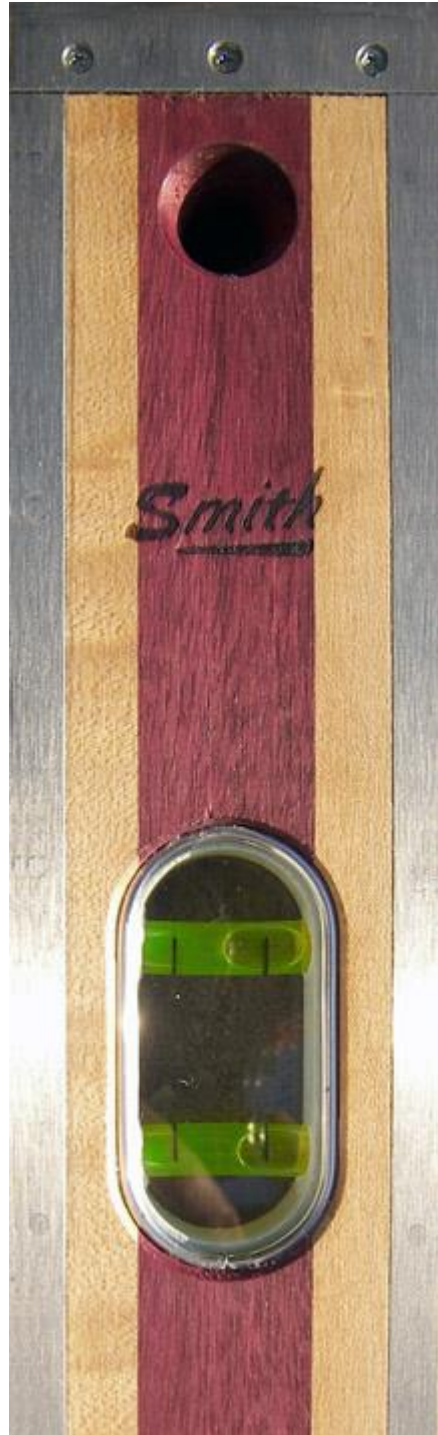
3 - Lamination Maple and Purple Heart