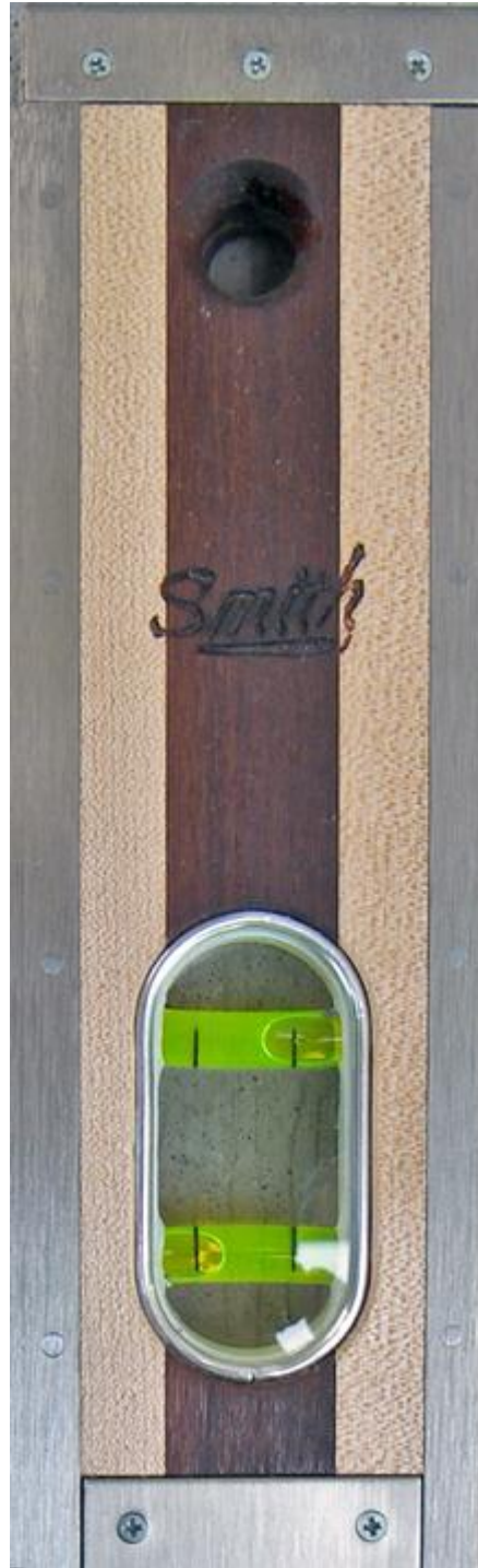
3 - Lamination Maple and Walnut