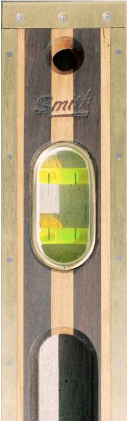
5 - Lamination Cherry and Walnut