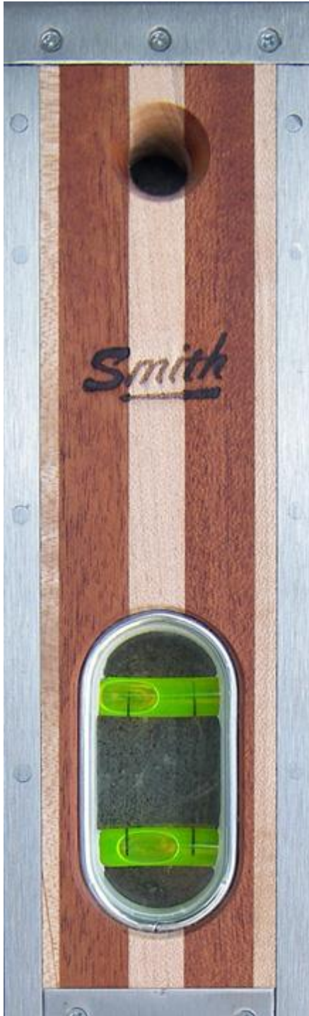
5 - Lamination Maple and Mahogany