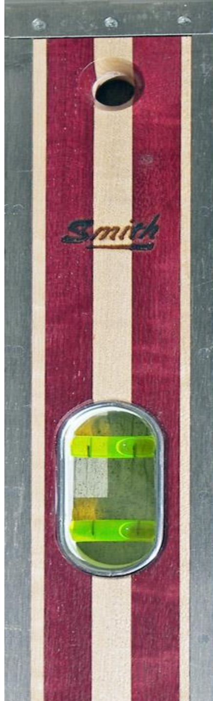
5 - Lamination Maple and Purple Heart